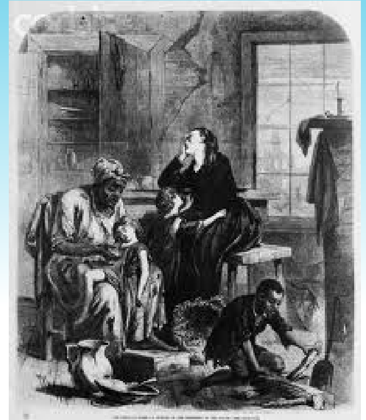
Family in poverty after the Civil War